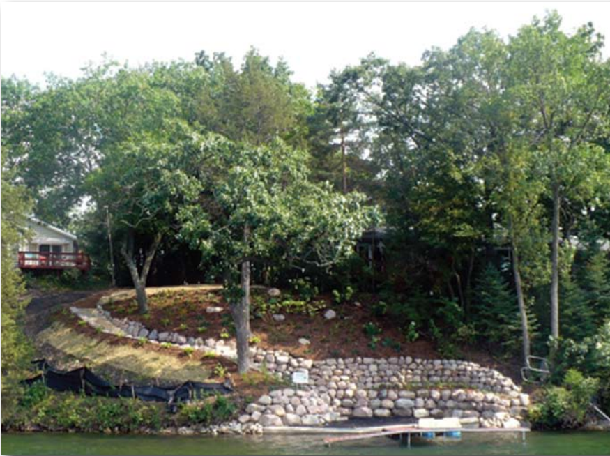
A view from the lake the shows the grace and magnitude of this project.

drama of the existing site. He started out by creating an entirely new grading plan for the site, one that would accommodate the wall-height restrictions but still enable the owner to build an effective retaining wall for the entire height of the embankment.