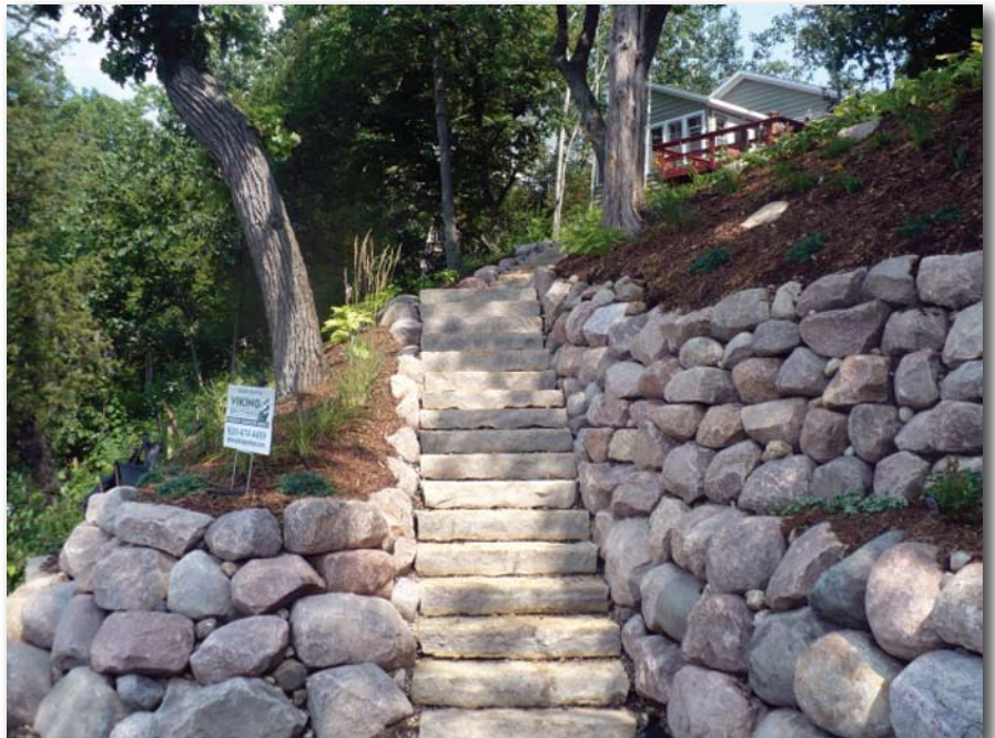
A clear view of the completed retaining wall and Lemke stone steps.